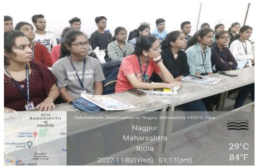
Students listening to Seminars